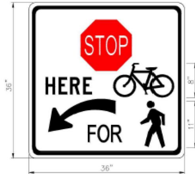
New City of Houston Sign